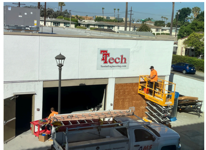
Contractors Finishing Air Conditioning Installation